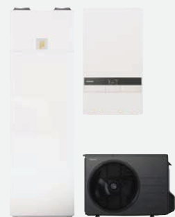
Heat Recovery Ventilation + DHW Square Tank + Aquarea Bi-bloc