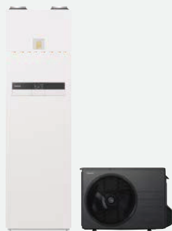
Heat Recovery Ventilation + Aquarea All in One Compact

Combine the Residential ventilation unit with Panasonic Aquarea for an space saving and highly efficient solution for heating, cooling, ventilation and DHW.