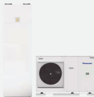
Heat Recovery Ventilation + DHW Square Tank + Aquarea Mono-bloc